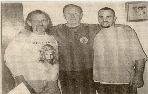
Three Generations Of Karate

Over the past eight years we have accumulated over 10,000 digital pictures of every special moment in our Dojo from Rank Tests to Belt Promotions to Grand Openings to Birthday Parties to Tournaments to renovating each of our two Dojos to everything else in between. We often get requests for Sensei to email a copy of the pictures. Due to the extensive time taken to catalog each picture and also for the time to actually email pictures effective immediately there will be a $10 charge for each and every picture taken at the Dojo that you would like a digital copy of. It is SO great to be able to look back on the special moments you or your child have had at The Karate Dojo and to see how far we have come and how much we have grown! Please let us know if there are any pictures you would like. All pictures taken at The Karate Dojo are property of The Karate Dojo.